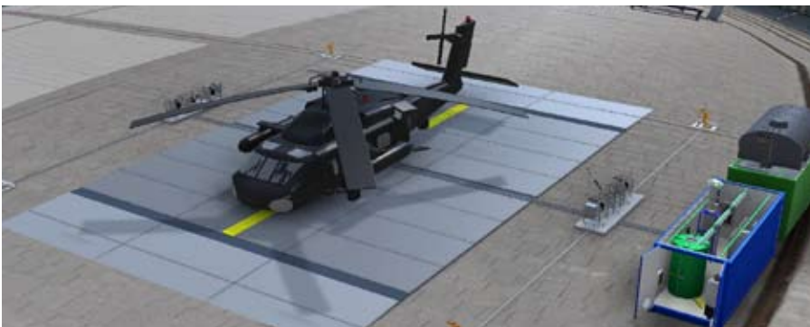
Above-ground, deployable, steel wash rack system with pumps, tanks and filtration in ISO containers. Drawing also depicts additional option for two manual wash stations.