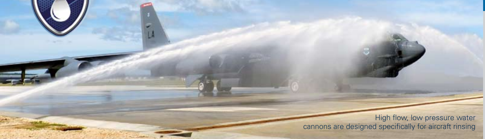
High flow, low pressure water cannons are designed specifically for aircraft rinsing

Adheres to T.O. 1-1-691, Aircraft Weapon Systems Cleaning and Corrosion Control (NAVAIR 01-1A-509, TM 1-1500-344-23-2)