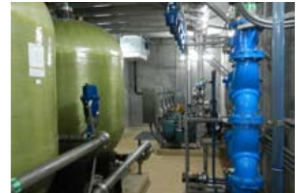
Pumps and filtration system can be installed in a building or in 20' all-weather ISO containers.