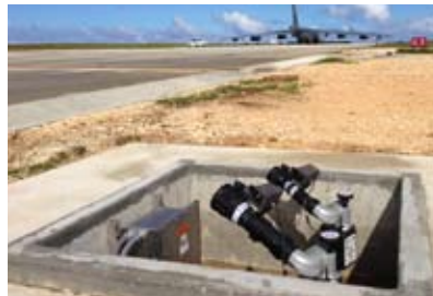
All equipment is housed below surface level to meet airfield requirements.