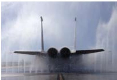
Spray pattern are programmed to change depending on the type of airframe coming through.

Like all Riveer systems, the BirdBath CWRS is completely customizable to the unique requirements of your project. Optional features include automatic wind-correction and integrated wash stations with air-powered foaming guns and turbine engine flush.